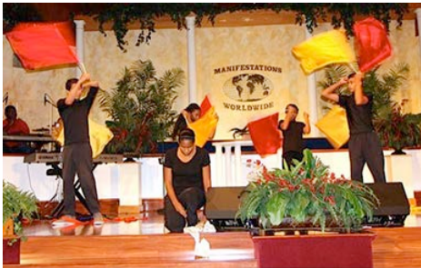
The EXA Dance Team demonstrating their talents

Our recollections of 2014 would not be complete without a mention of our first Unity in the Faith Community Worship Night held on November 1 st , 2014.