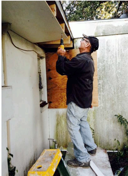
Butch Davis in action