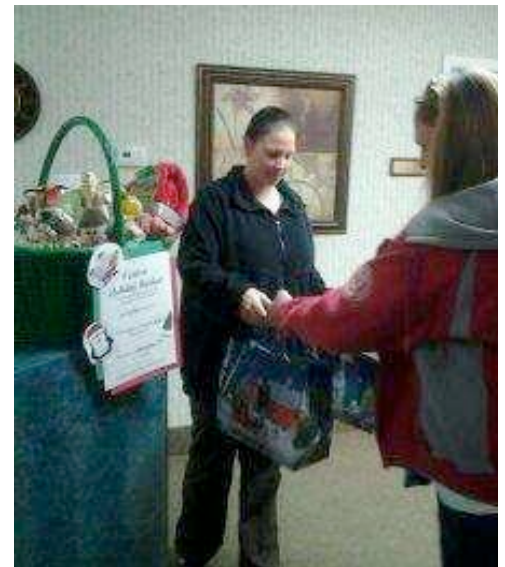
Trinity residents deliver cookies to local nursing home

The official Grand Opening of Trinity House in June 2014 was an important and emotional milestone in our history, and we could not have been more amazed of what we accomplished collectively, each in our own way but with a common goal: to be of service to God, the ultimate Provider. Indeed, "Unless the Lord builds the house, its builders labor in vain. Unless the Lord watches over the city, the watchmen stand guard in vain" (Ps. 127:1). What would we be without Him?