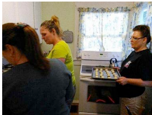
Trinity women bake Christmas cookies for the elderly

We could not have achieved as much as we did without the financial support of businesses and private donors! To them we are forever indebted!